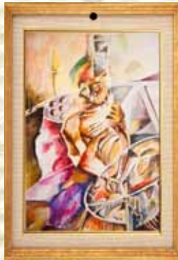
LEYTISHA JACK - PAN MAN MULTICOLOUR PRINT ON PAPER | PRINTMAKING