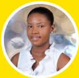
TITLE: YOUNG PLAYERS (2012) ARTIST: KITHESHA JAMES

Young students are gathered in an after school steel pan practice session. Growing orchestras is evidence of a generation that strongly appreciates pan which has become a vital instrument and a popular medium of expression for our youth.