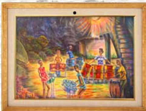
ROLIVIA STEPHENS - HARMONY IN D YARD MIXED MEDIA ON WATER-COLOR PAPER | PAINTING